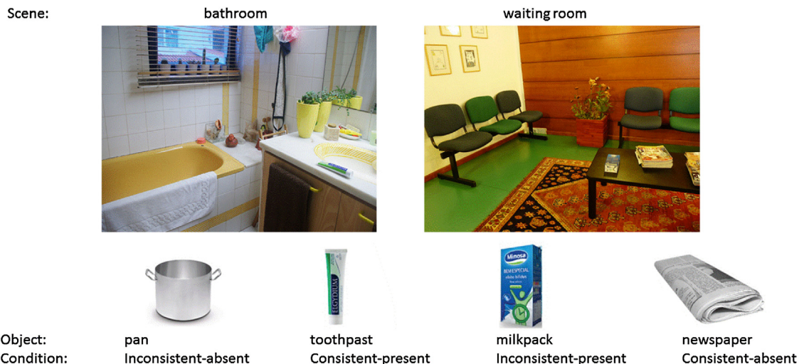
Fig. 1. Examples of the stimuli used in the four conditions.

Accuracy (see Fig. 3) was analysed by repeated measures ANOVAs, where Group (ASD, TD) was the between-subjects variable and Context (Consistent, Inconsistent) and Presence (Present, Absent) were the within-subjects factors.